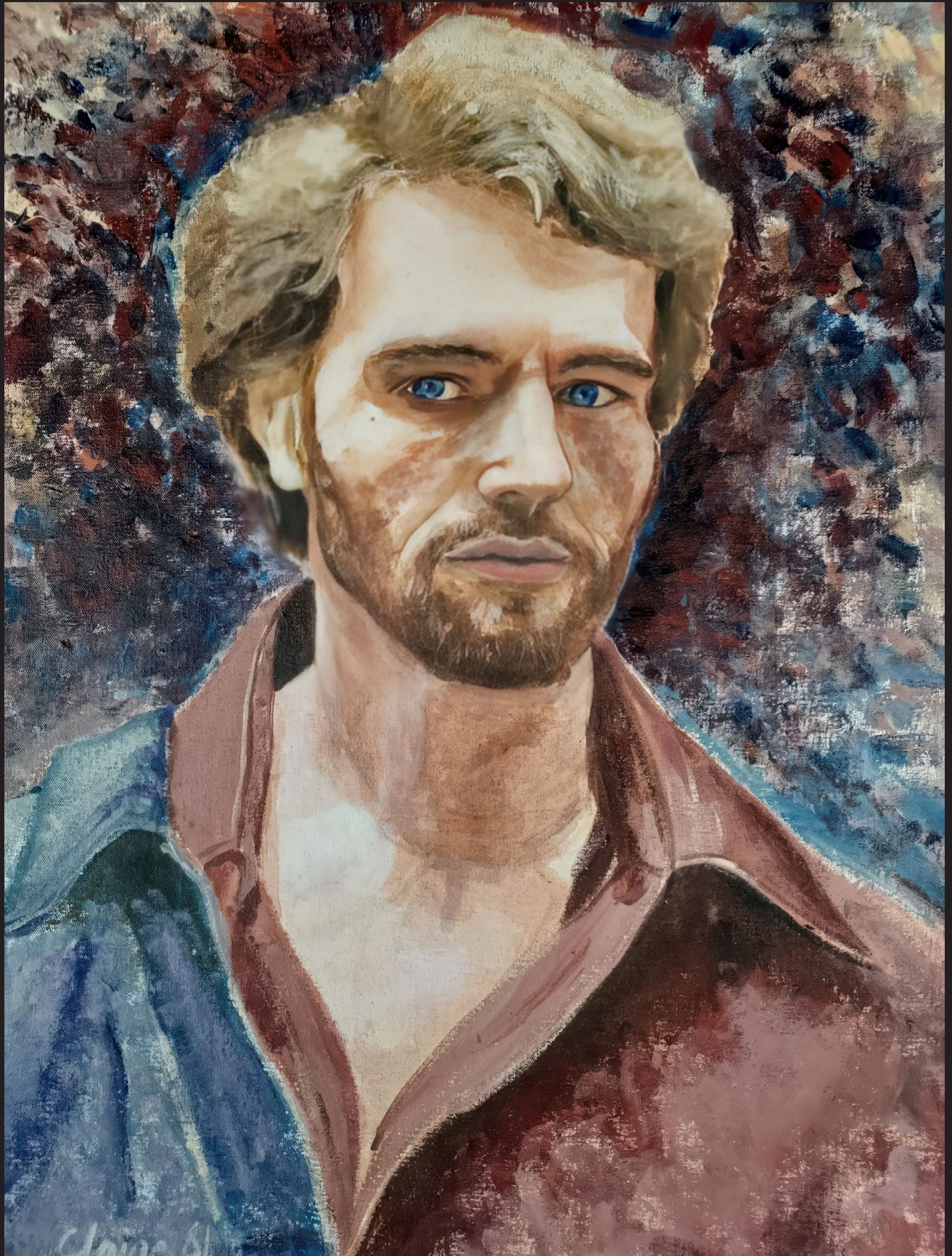
"Claude" oil, 28in x 22in x 1in, 2018, $1450