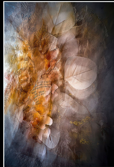
"Sonogram of the Universe" by David Day, Intentional Camera Movement Photography, 19in x 13in x 0.25in, 2025, $110