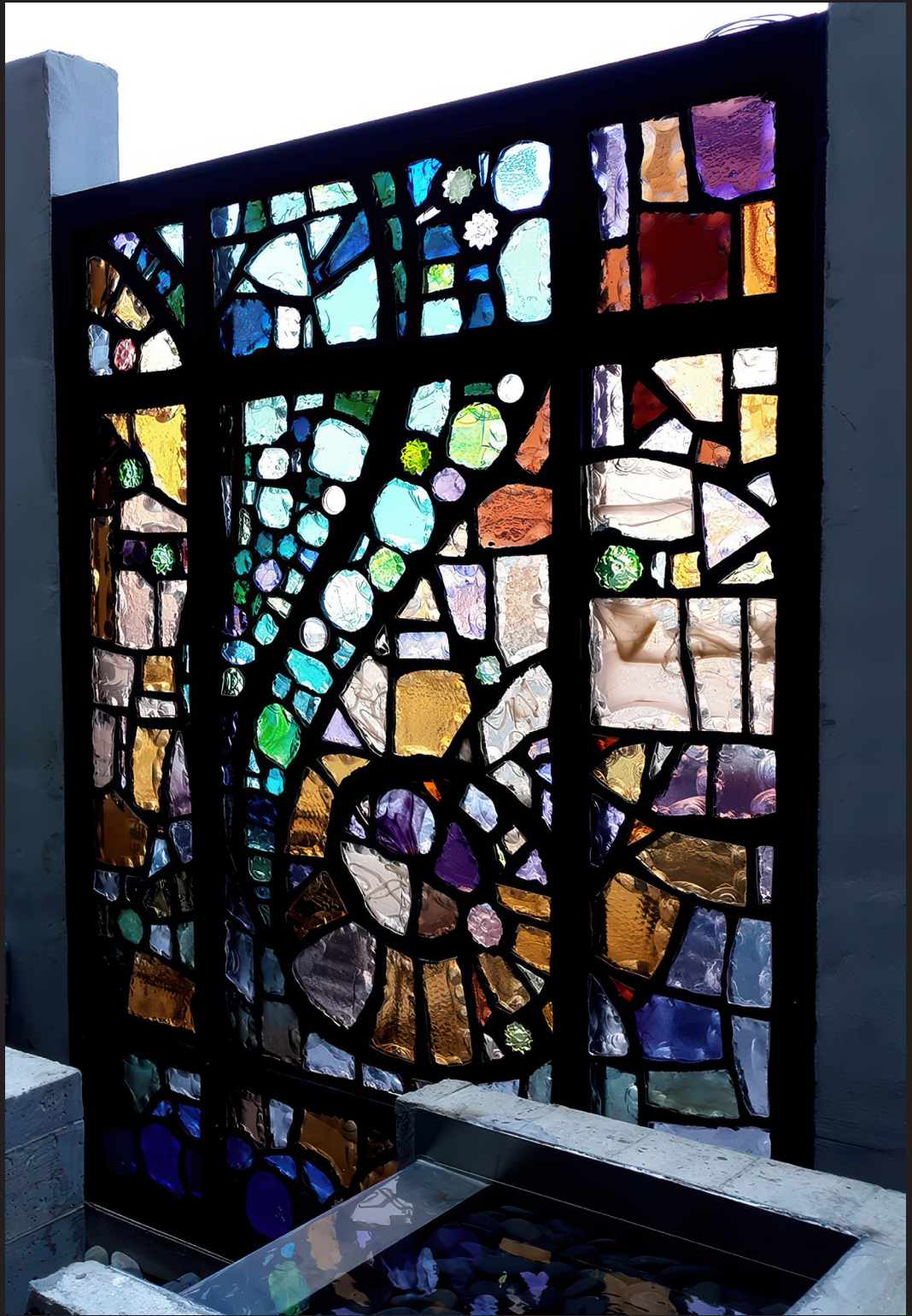
"Nautilus" by Suzy Hendrix, aluminum, exterior grade cast glass, resin, 7ft x 5ft x 0.5ft, 2019, $12000