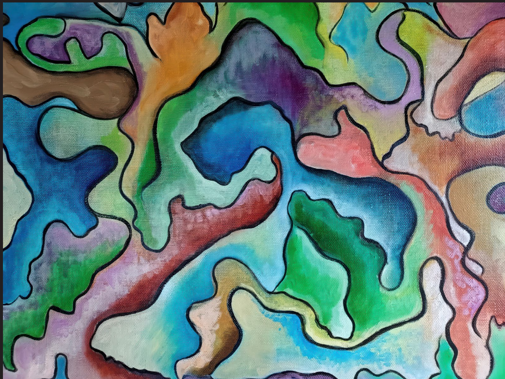
"Celestial Rhythms" oil, 24in x 36in x 1in, 2021, $1800

See more of Claire's art at: Web.clairekerven.com